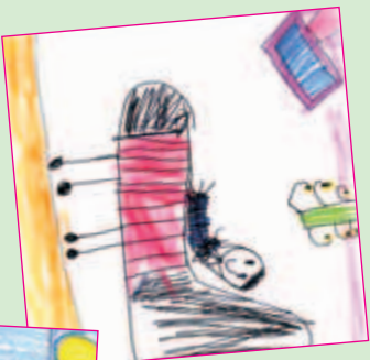
4 TO 6-YEAR-OLDS Abigail Chandler Age 6, Silver Spring, MD