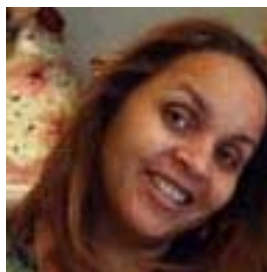
MID-ATLANTIC Regional Representative